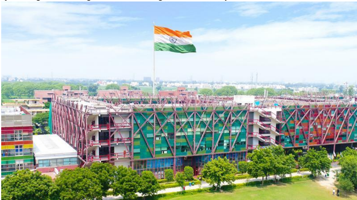
Jindal Global Law School, O.P. Jindal Global University, Sonipat, India

To succeed in law school, an individual must adopt an active approach, make effective use of available resources, and engage actively in the learning process. Effective academic foundations, proficient research and writing abilities, and the selection of an appropriate academic institution are all critical foundations that support a prosperous legal profession. This chapter explores techniques and perspectives for effectively managing the obstacles and optimizing the advantages that arise throughout the critical years of law school.